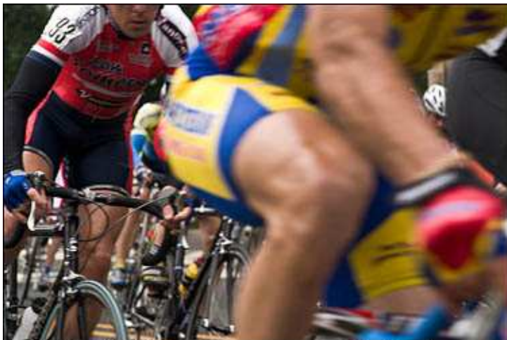
All About the Bike