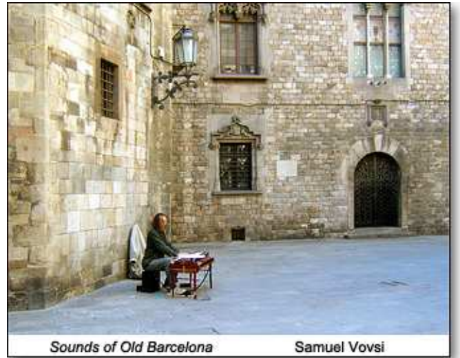
Sounds of Old Barcelona