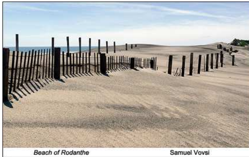
Beach of Rodanthe