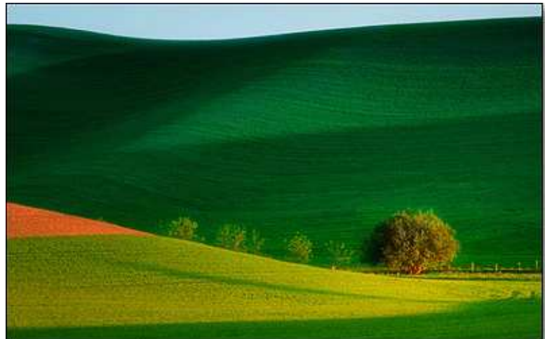
Tree at Sunset