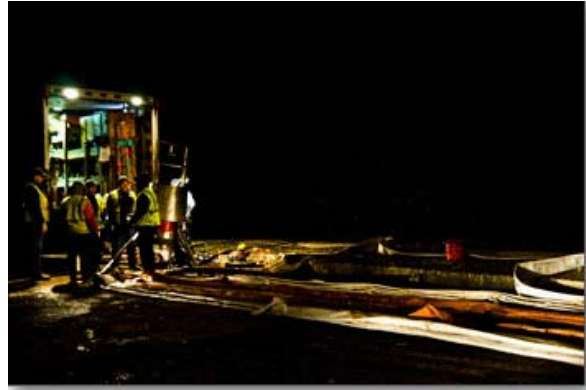
Night Team Sewer Emergency Bill Slack

Maia Reim two images, "Pledge" and "Shadow Play", well accepted into the Mercer Country Photography show as well.