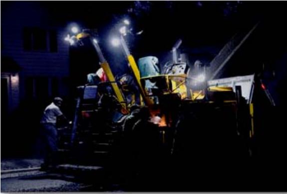
Night Team Paving. Bill Slack

Bill Slack's insomnia seems to have sparked a shot of creativity as his two nocturnal images "Night Team Paving" and "Night Team Sewer Emergency" also were accepted into the Mercer Country Photography 2011 Exhibit .