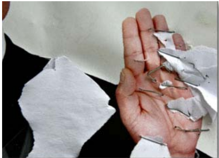
Pledge Maia Reim