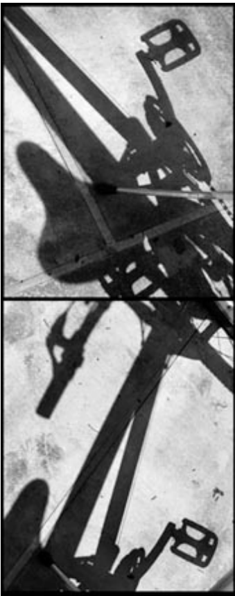
Shadow Play Maia Reim

Maia Reim two images, "Pledge" and "Shadow Play", well accepted into the Mercer Country Photography show as well.