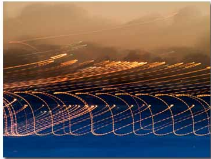
Staten Island 4