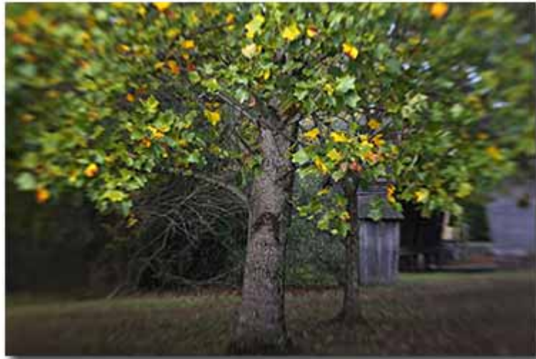
Basto by Wayne Klaw

Wayne Klaw got his image "Basto" in the show "RAW" at the Noyes Museum of Art. The museum is located at 733 Lily Lake Road, Oceanville with open n hours 10:00 AM to 4:30 PM. The show runs until May 12.