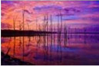
Manasquan Reservoir County Park